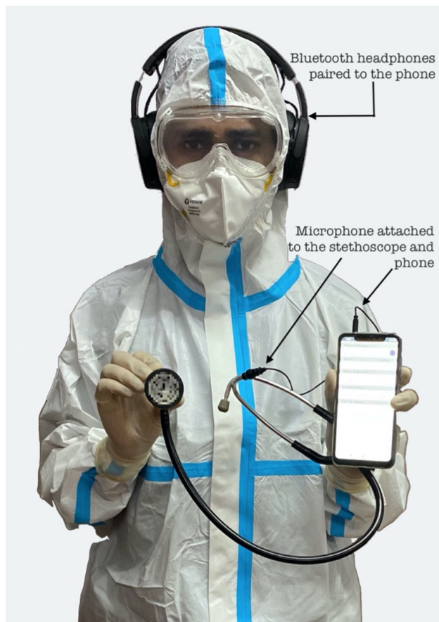
Figure 2 Do-it-yourself stethoscope used in COVID-19 facilities.

an instrument which generates sound of various frequencies and at varying intensities and the output is assessed using the spectral analysis. 9 10 Another method to compare stethoscopes is rating by the observer of different devices on a Likert scale on various parameters such as intensity of sound, noise, comfort, etc. 11–13 We opted for this approach, as although being subjective, this approach captures the real-world scenario and allows testing in various settings such as in ventilated patients or noisy environment of wards as compared with quiet testing in a laboratory.