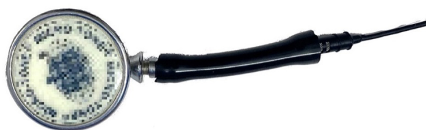
Figure 3 Microphone attached at chestpiece.

Compared with other electronic stethoscopes, this device provides similar functionalities such as sound amplification, noise reduction, and the ability