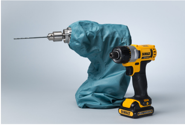
Figure 1 Arbutus Medical Drill Cover fully sealed with DeWalt drill beside.

drills, with serious consequences, including disfigurement, severe infection and loss of life. 5 In 2012 the lead author undertook an orthopaedic fellowship at Beit-CURE International Hospital in Malawi, where he observed the practice of wrapping a commercially available hardware drill with an unsterile crude cover; a common practice across LMICs. At the same time, in Uganda a group of biomedical engineering students from the University of British Columbia also witnessed the same behaviours and sought to convert this jugaad practice into a frugal innovation through a structured innovation and design process. 6,7 Arbutus Medical Inc. was incorporated in 2014 for the purposes of commercialising the company offering.