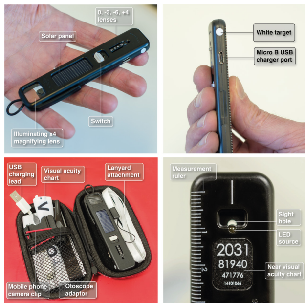
Figure 1 The Arlight with selected features highlighted.

create a slim (110 mm long×26 mm wide×9 mm thick) and light device (18 g).