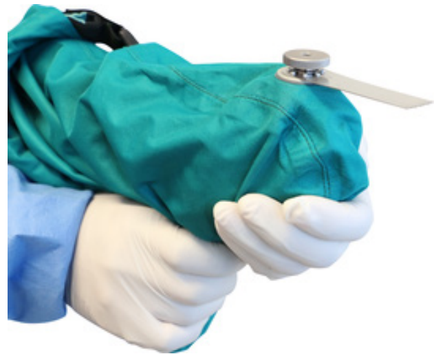
Figure 5 Oscillating saw launching towards the end of 2017. Product will feature a quick-change cam mechanism for easily switching blades (not shown here).

and manufacturing techniques follow an AAMI/ANSI PB70 standard for Level 4 medical barriers. The Drill Cover is CE marked as a Class I medical device, registered with the US Food and Drug Administration and approved with Health Canada. Further tests are being conducted to reclassify the whole package of cover plus drill as a CE Class IIa device.