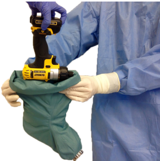
Figure 3 Drill Cover System being assembled.

textile which attaches to a drill's mechanics via a waterproof chuck adapter interface (figures 1–6). This creates a completely sealed barrier between the non-sterile drill on the inside and the sterile surgical field outside. The chuck has a lifetime of at least 600 use cycles when reprocessed appropriately. It can be autoclaved up to 75 times and will be sterile after 30 min exposure of steam autoclave at 121°C, or after 15 min at 131°C, either by using gravity displacement or prevacuum autoclaves. 10