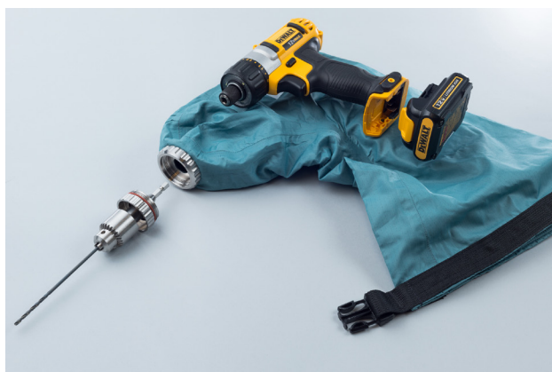
Figure 2 Arbutus Medical Drill Cover System disconnected to show chuck mechanism and linen, with DeWalt drill beside.

Over a 2-year period the Institute of Global Health Innovation (IGHI) has conducted an international search for frugal innovations with potential application