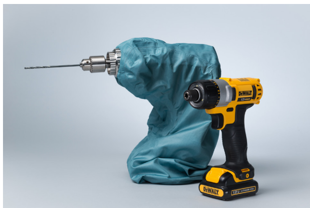
Figure 1 Arbutus Medical Drill Cover fully sealed with DeWalt drill beside.

drills, with serious consequences, including disfigurement, severe infection and loss of life. 5 In 2012 the lead author undertook an orthopaedic fellowship at Beit-CURE International Hospital in Malawi, where he observed the practice of wrapping a commercially available hardware drill with an unsterile crude cover; a common practice across LMICs. At the same time, in Uganda a group of biomedical engineering students from the University of British Columbia also witnessed the same behaviours and sought to convert this jugaad practice into a frugal innovation through a structured innovation and design process. 6,7 Arbutus Medical Inc. was incorporated in 2014 for the purposes of commercialising the company offering.