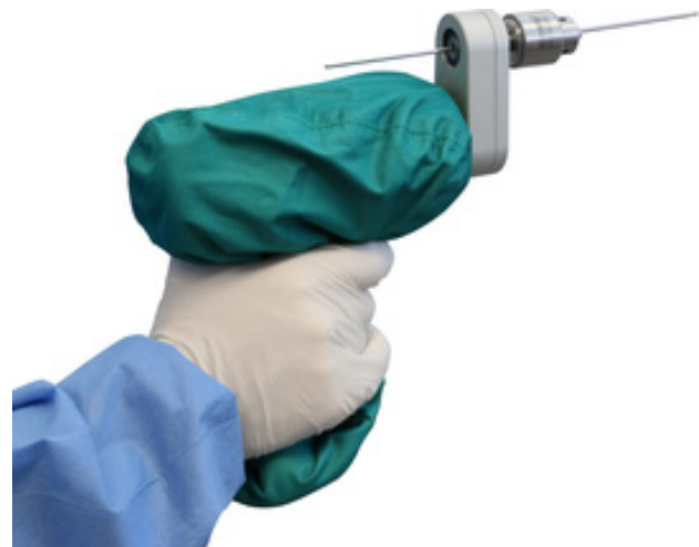
Figure 6 Cannulated drill and reamer launching early 2018. This features a universal quick-change interface for easy exchange of AO, Jacobs, Hudson and K-wire collet during practice.

The Arbutus Drill Cover System is assembled by inserting a non-sterile hardware drill into a sterile cover. The bag edges are rolled down with fingers tucked under during loading, before being rolled back and sealed to encase the hardware drill. (For loading and assembly, please see online supplementary video 2). This is a standard process used in other types of surgery to provide a sterile barrier, most notably