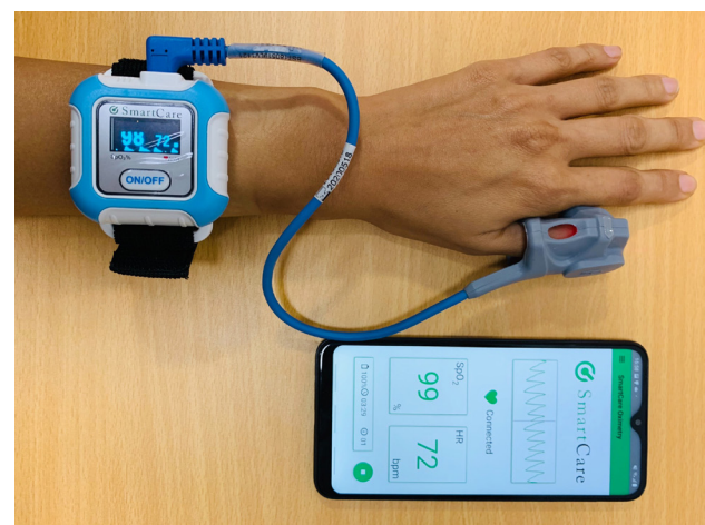
Figure 2 Wearable pulse oximeter device and smartphone display used for remote monitoring.

The prototype is composed of a low-cost wearable, a Bluetooth-enabled mobile device and a mirror screen application. The wearable is a medical-grade, wrist-worn, fingertip pulse oximeter able to deliver signals to a mobile device in real-time via Bluetooth ( figure 2 ). The mobile device could be either smartphone or tablet, in which discrete applications are installed for signal receipt, analysis and screen mirroring. In this study we used a SmartCare wearable (SmartCare Analytics, London, UK) to transmit